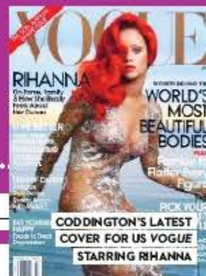
CODDINGTON'S LATEST COVER FOR US VOGUE STARRING RIHANNA