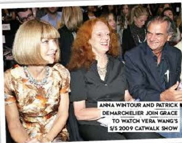
ANNA WINTOUR AND PATRICK DEMARCHELIER JOIN GRACE TO WATCH VERA WANG'S S/S 2009 CATWALK SHOW

By Christmas 1986, with Wintour editing British Vogue (a stern regime which Grace found suffocating; she told Wintour, "You don't need a fashion director because you're it."), she left for a job at Calvin Klein. It was a challenging time, "[Calvin's] moods seemed to swing as frequently as he changed his mind," noted