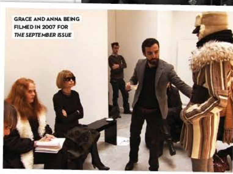
GRACE AND ANNA BEING FILMED IN 2007 FOR THE SEPTEMBER ISSUE