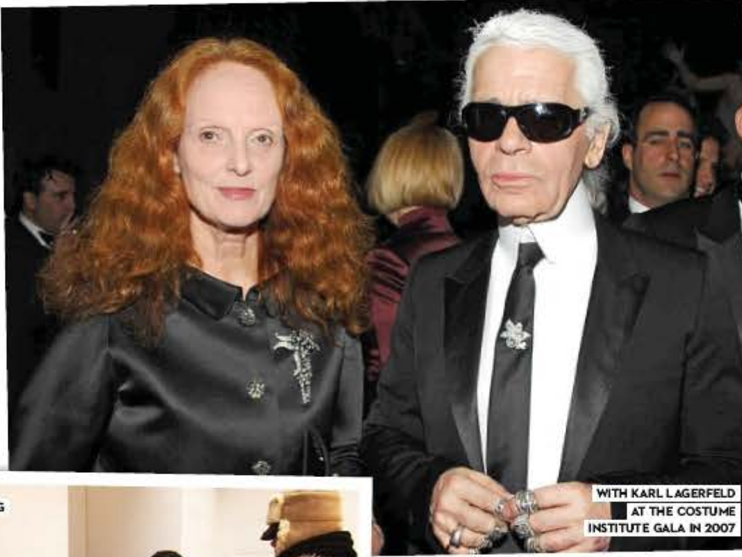
WITH KARL LAGERFELD AT THE COSTUME INSTITUTE GALA IN 2007

And as other editors tweeted from the front row and captured passing looks with camera phones, she produced detailed sketches of key looks. Coddington exited fashion shows briskly, sidestepping the TV crews who charge at high-profile editors for commentary. "I can't stand it when editors become larger personalities than the people or the clothes they are shooting," she's said. But while she is