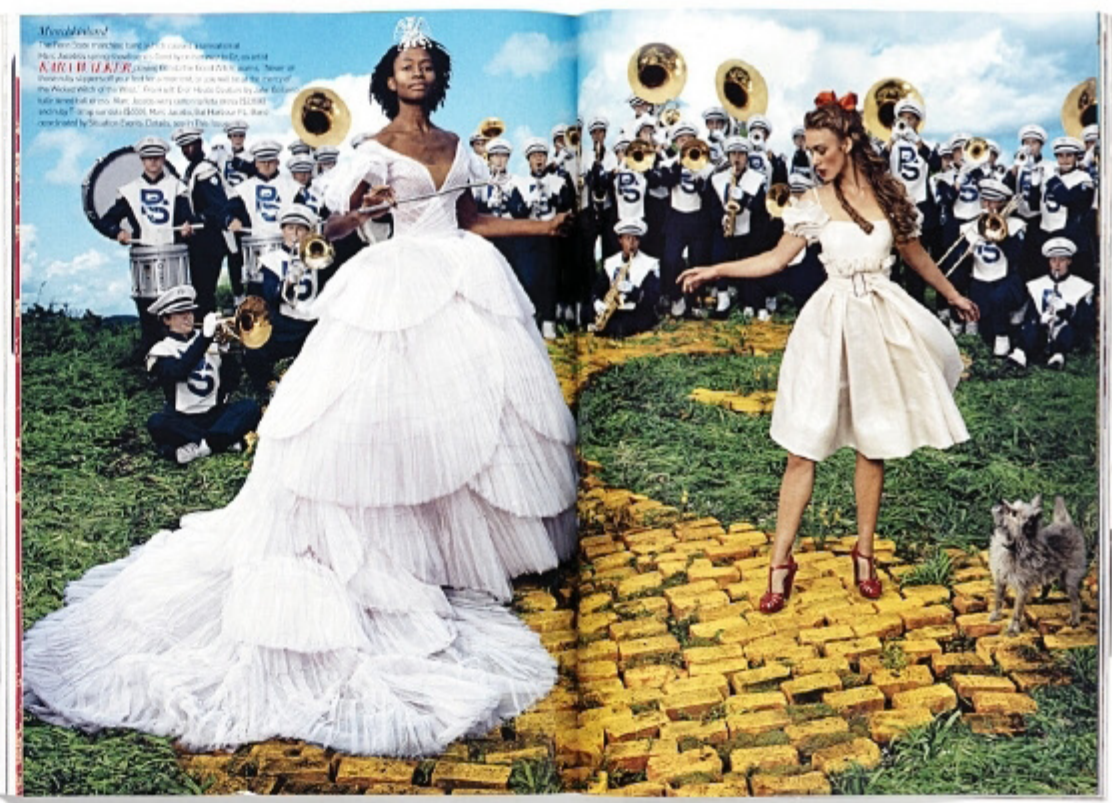
All shoots styled by Grace Coddington for American Vogue